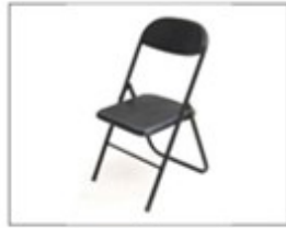
F26 黑皮折椅 Black Folding Chair