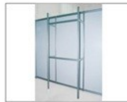
F7 挂架 Hanger Stand 1990 × W495 × H2480 (MM)