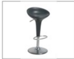
F30 吧椅 Bar Chair