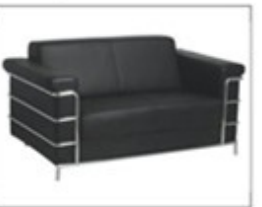
F33 双人沙发 Double Sofa