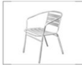
F27 银扶手椅 Silver Armchair