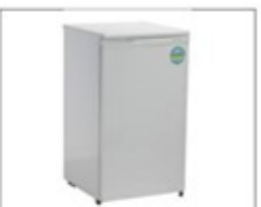
F34 冰箱 (90L) Refrigerator (90L)