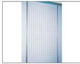
F18 网片 Steel Grid L1000 × H1500 (MM)