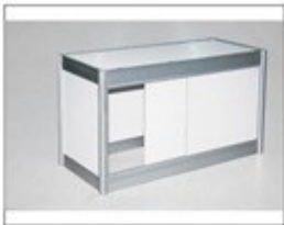
F9 地柜 Cabinet 1990 × W495 × H750 (MM)