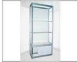
F2 展柜 (玻璃层板) Showcase (with glass shelves) 1990 × W495 × H2000 (MM)