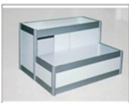
F13 高低展柜 (B) High-low-combined Display Counter (B) 1990 × W495/495 × H750/300 (MM)