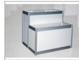
F12 高低展柜 (A) High-low-combined Display Counter (A) 1990 × W495/495 × H1000/750 (MM)