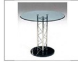
F23 玻璃圆台 Glass Round Table R100 × H800 (MM)