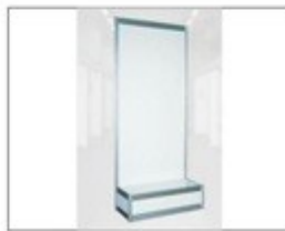
F6 前言牌 Bulletin Board 1990 × H2480 (MM)