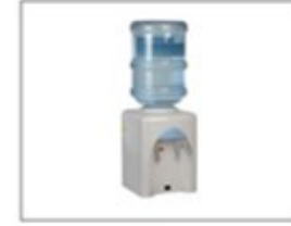
F28 饮水机 (含1桶水) Water Dispenser (one bottle of water is on free)