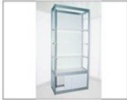
F1 展柜 (木层板) Showcase (with wooden shelves) 1990 × W495 × H2000 (MM)