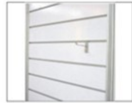
F20 槽板 Groove Plate L1000 × H2400 (MM)