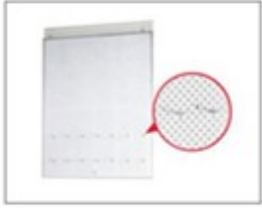
F21 洞洞板 Peg Board L968 × H1188 (MM) 洞距 8 (MM)