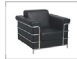
F32 单人沙发 Single Sofa