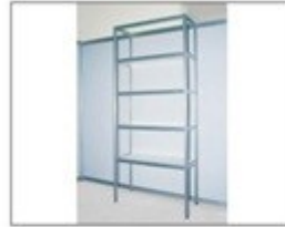
F3 展架 (木层板) Shelves Stand of Aluminum Alloy 1990 × W495 × H2000 (MM)