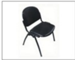
F31 胶椅 Plastic Chair