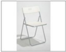
F25 折椅 Folding Chair