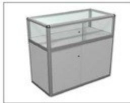
F10 玻璃矮饰柜 Short Display Counter 1990 × W495 × H1000 (MM)