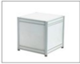
F17 小展示台 Small Show Counter L195 × W195 × H500 (MM)