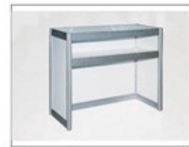
F8 报到台 Register Counter 1990 × W495 × H1000 (MM)