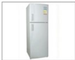
F35 冰箱 (140L) Refrigerator (140L)