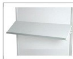
F15 斜搁板 Inclined Shelf 1990 × W310 (MM)