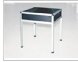
F22 铝合金方台 Square Table of Aluminum Alloy L650 × W650 × H680 (MM)