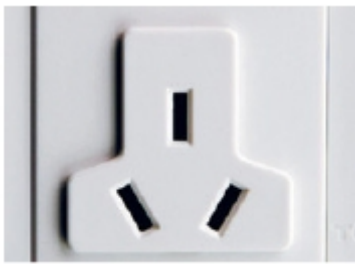
5 Amp / 220 Volt

The Chinese sockets in the exhibition halls look like this: