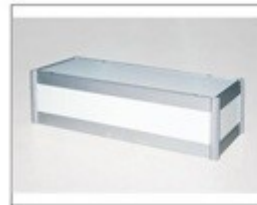
F11 展台 Show Counter 1990 × W495 × H300 (MM)