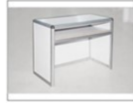
F24 铝合金咨询台 Consultation Counter L950 × W450 × H760 (MM)