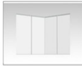
F19 隔板 Panel Board L960 × H2180 (MM)