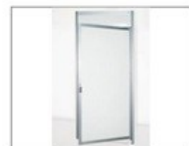
F16 铝合金门 Install Aluminum Door L1000 × H2400 (MM)