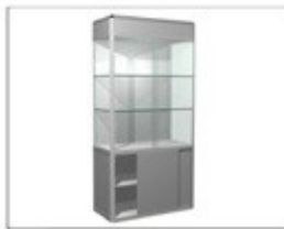
F5 玻璃高柜 Tall Display Counter (no light inside) 1990 × W495 × H2000 (MM)