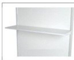
F14 平搁板 Flat Shelf 1990 × W310 (MM)